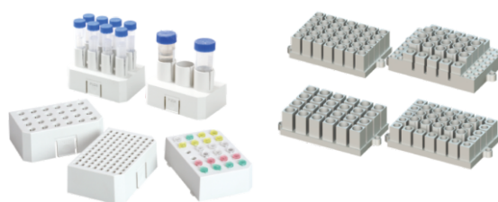
Blocks for TMS-200/TMS-300